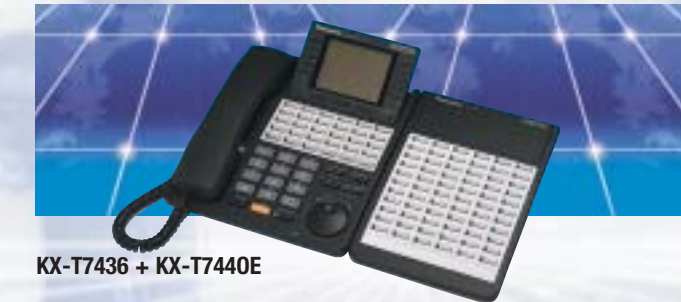
KX-T7436 + KX-T7440E