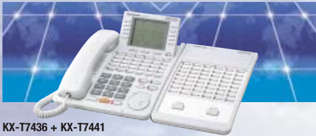
KX-T7436 + KX-T7441