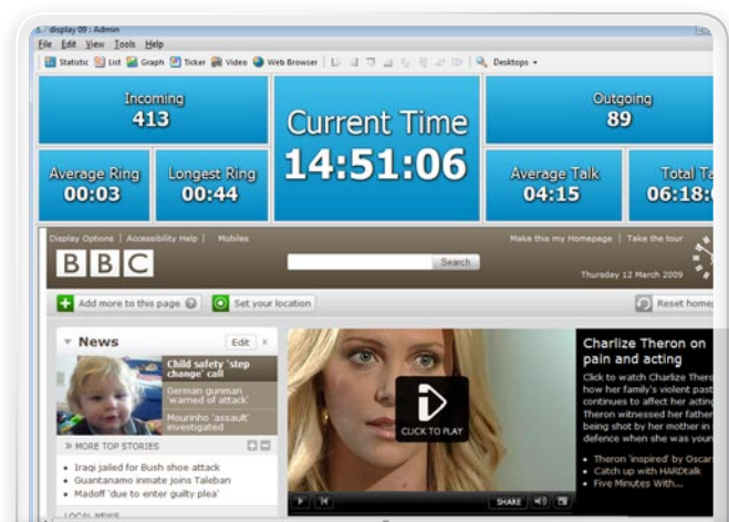
Combined - Web pages, video feeds, XML database feeds and more, combined with call logging statistics.